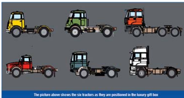
The picture above shows the six tractors as they are positioned in the luxury gift box

DAF 2000 The first series of heavy trucks